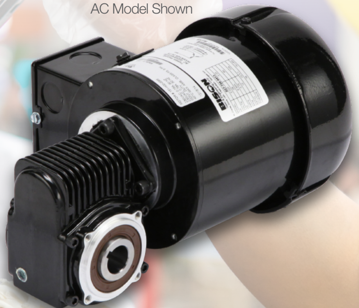
750 Series Right Angle Gearmotor AC Model Shown

Soft serve machines use motors and gearmotors to mix the product and pump air into the barrel, creating the necessary pressure for dispensing. Bison® was already supplying a custom parallel shaft AC gearmotor to one of the largest machine manufacturers for the pump application. They were then engaged in the early stages of the manufacturer’s next generation new product development (NPD), which incorporated self-cleaning features into the machines.